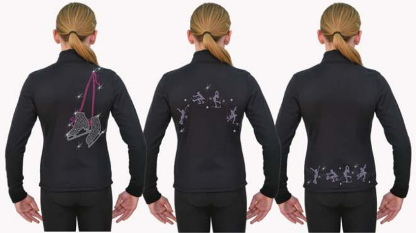
Crystal design printed on the back - Size approx. 11" x 8" Choose from the 11 designs listed below to print on all JT811 jackets with Thumbhole