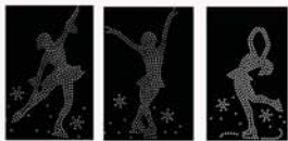
MSK MJM MLB