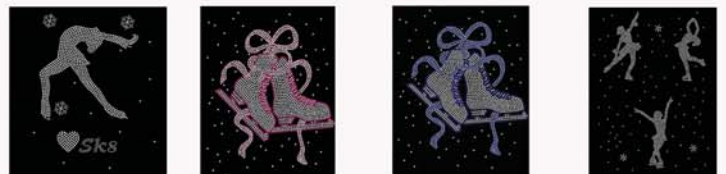
Sk8 RF RB AA

DISCLAIMER: All crystal transfers are custom made. Once applied, we do not accept returns or exchanges.