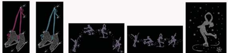
SKL-FS SKL-TQ GA GL SS