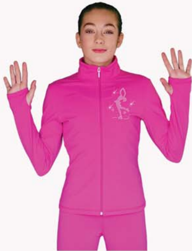
Mini Crystal design printed on left chest Size approx. 4" x 3" Choose from the 8 designs listed below to print on all JT811 jackets with Thumbhole