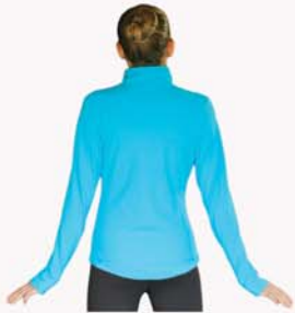
Round finishing bottom at the back of the jacket

Sizes: CXXS, CXS, CS, CM, CL, CXL/AXS, AS, AM, AL (AXL Black only)